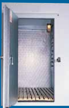
Coil Plate Interior (4 x 8 Shown)