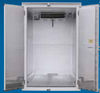
Auto Defrost Interior (5 x 9 Shown)